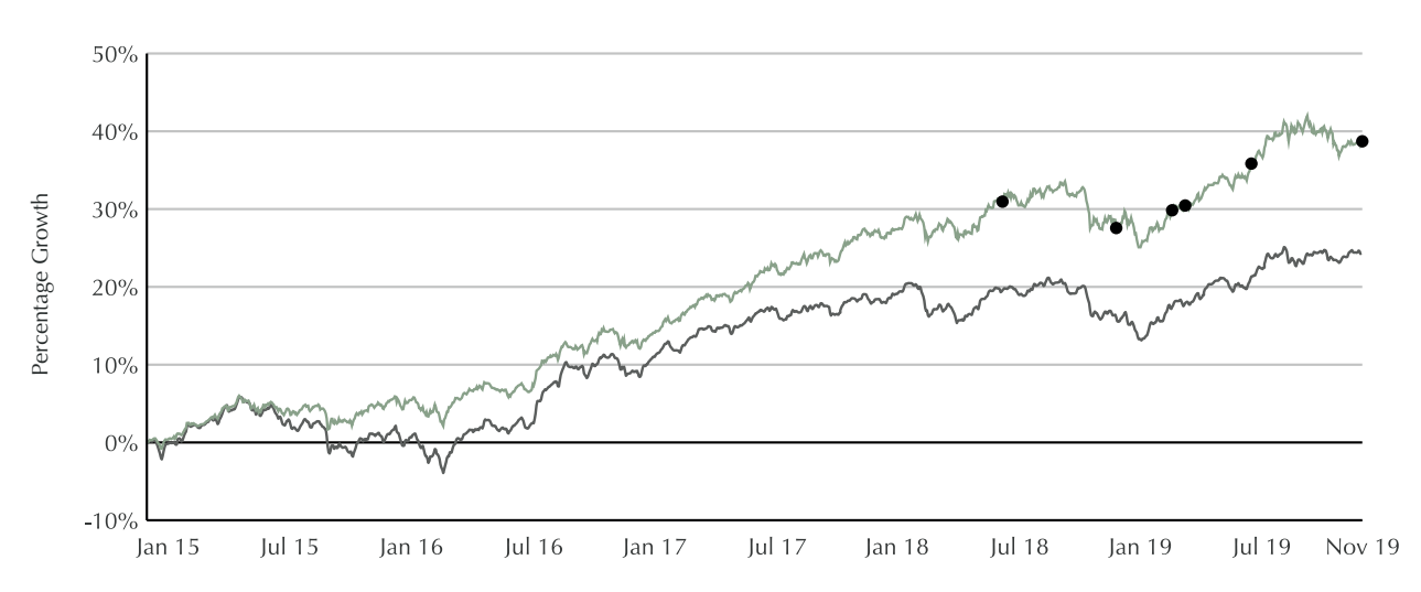
Powered by data from FE